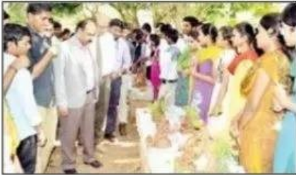
మట్టి వినాయకుల ప్రదర్శన