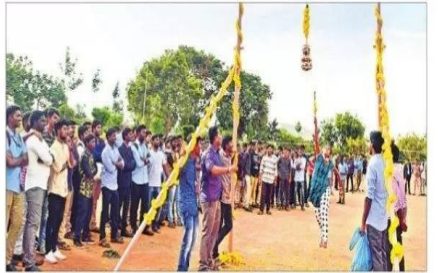
మిట్స్ లో ఉట్టికొట్టేటప్పుడు యువతి

కురవలకోట: మండలంలోని అంగళ్ల మిట్స్ ఇంజనీరింగ్ కళాశాలలో ఎంఎన్ఆర్ క్లబ్ సభ్యులు కృష్ణాష్టమి సందర్భంగా ఉట్టికొట్టి తాత్పర్యము అందివారం కనువిందుగా నిర్వహించారు. ఉట్టి కొట్టడానికి పోటీలు పడ్డారు. మిట్స్ లోని సోషల్ రిస్పాన్సిబిలిటీ క్లబ్ ఆధ్వర్యంలో ఉత్సాహంగా జరిగింది.